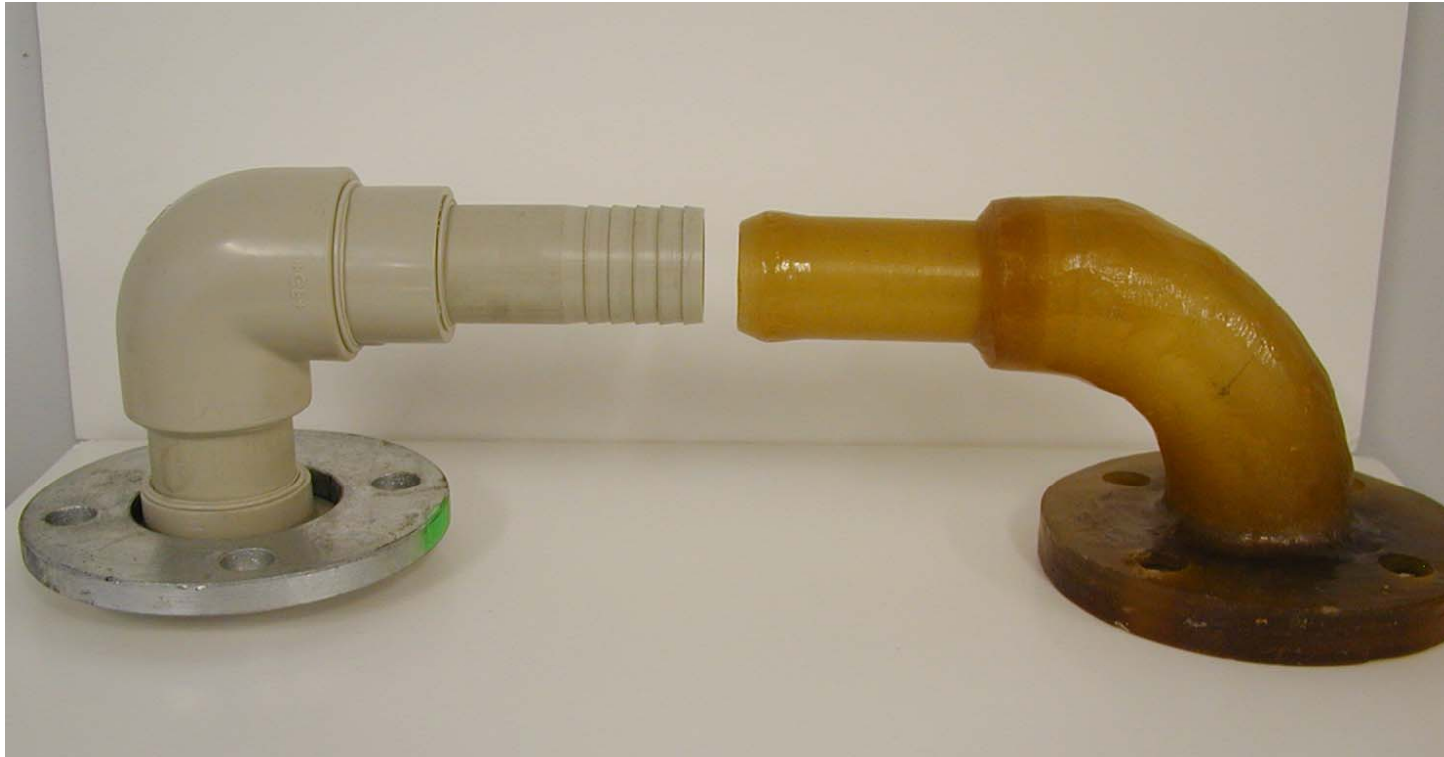
Polypropylene Elbow Fabricated by ACP Against Fiberglass